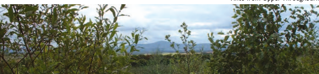
Tinto from Upper Throughburn